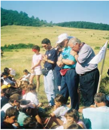
In His Grip Ministries, Inc.