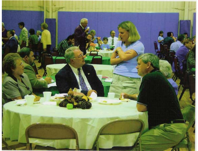
Fellowship meal after preaching at Home Coming Services- Standing Springs Baptist Church, Simpsonville, SC